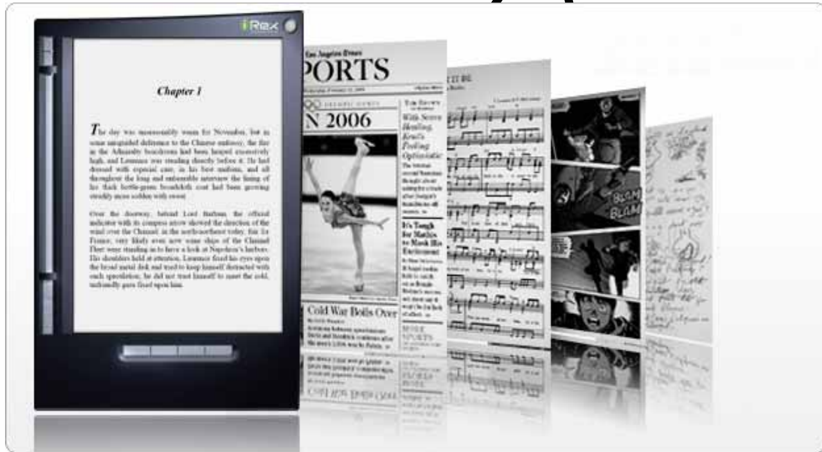
Open system approach